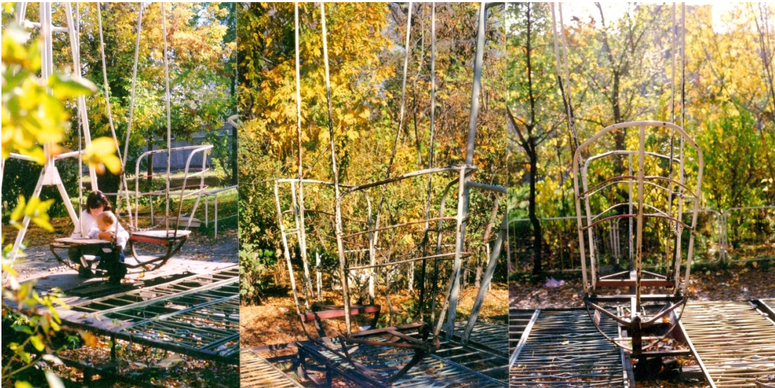
Who knows what life is?(22,5x45)