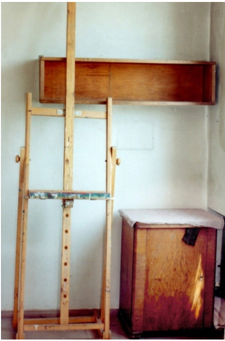
The artist is a human(40x30)