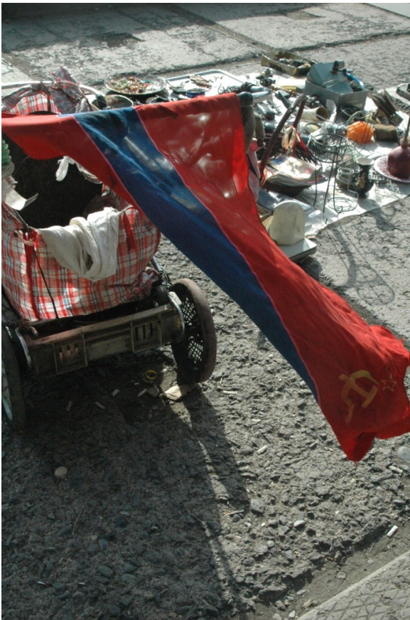
What's left of Soviet Armenia?(40x30)