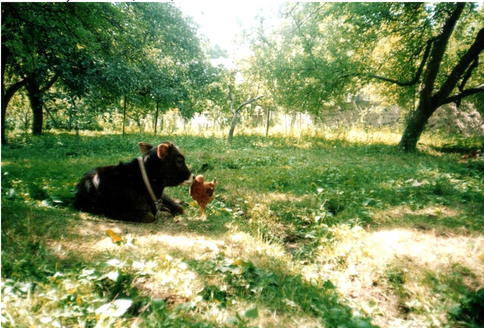
The sun shines more after the rain. (30x40)