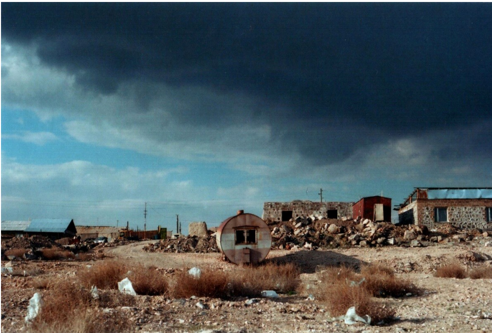
I want to write, but what should I write?(30x40)