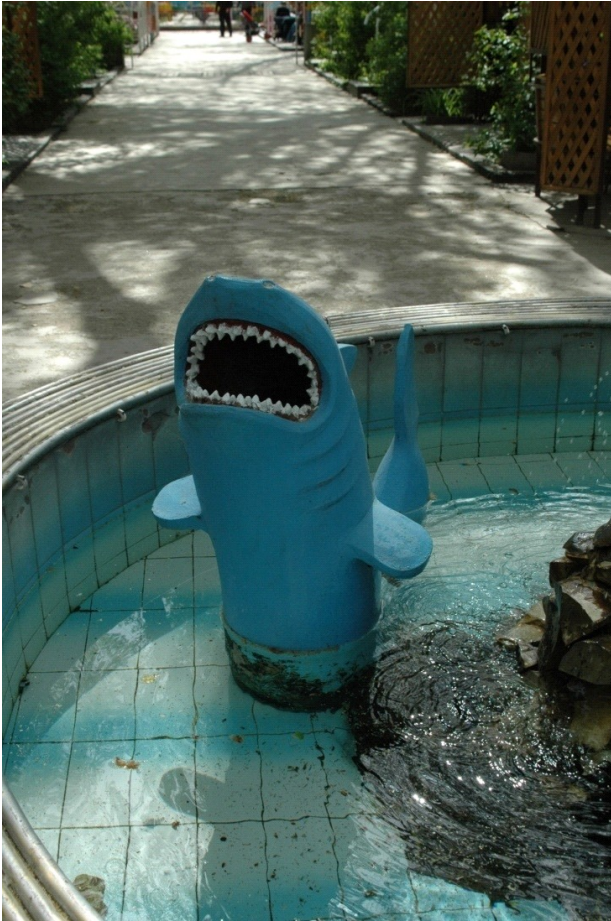
Animals say: be kind. (40x30)