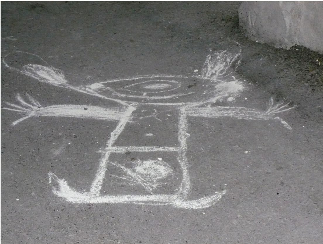
The artist is extraterrestrial.(30x40)