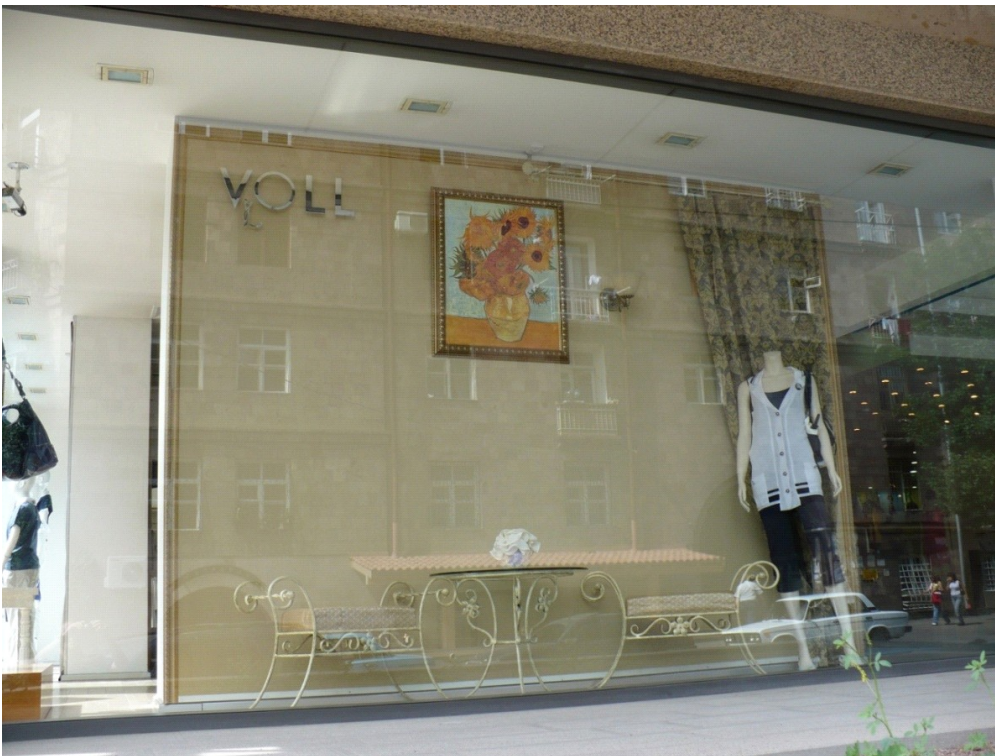
It's a store, not a world.(30x40)