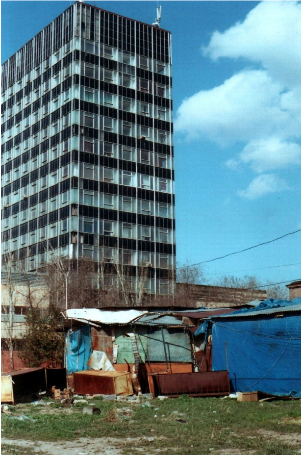
You have a home but your soul is elsewhere. (40x30)