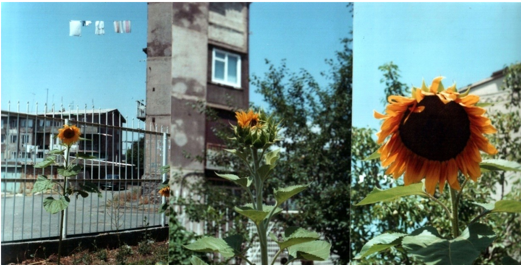
You haven' t seen the Sun? There it is. (22,5x45)