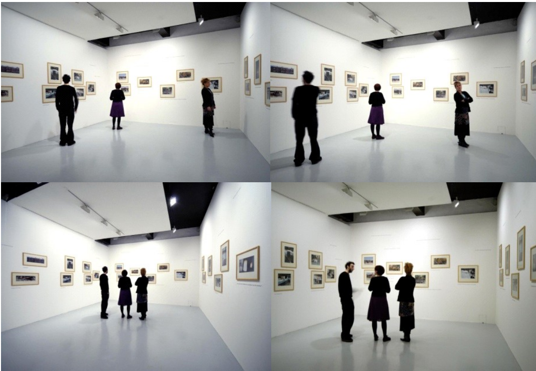
2007 D'Arménie Exposition Centre d'art contemporain de Quimper Quimper, France