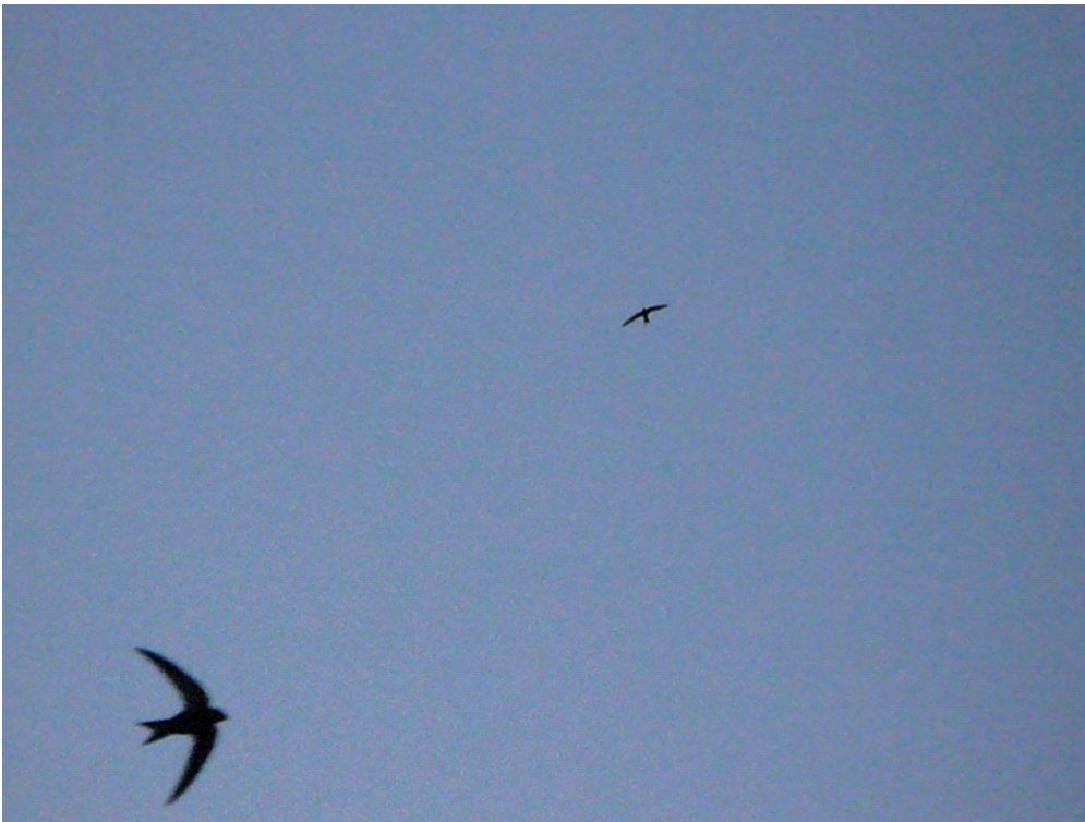
Spring will come soon.(30x40)