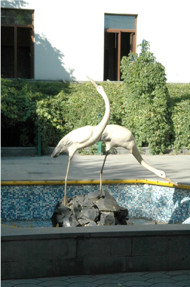
Mom says, the stork brought you.(40x30)