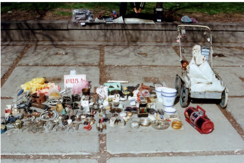
What am I supposed to do if this life gets better?(30x40)