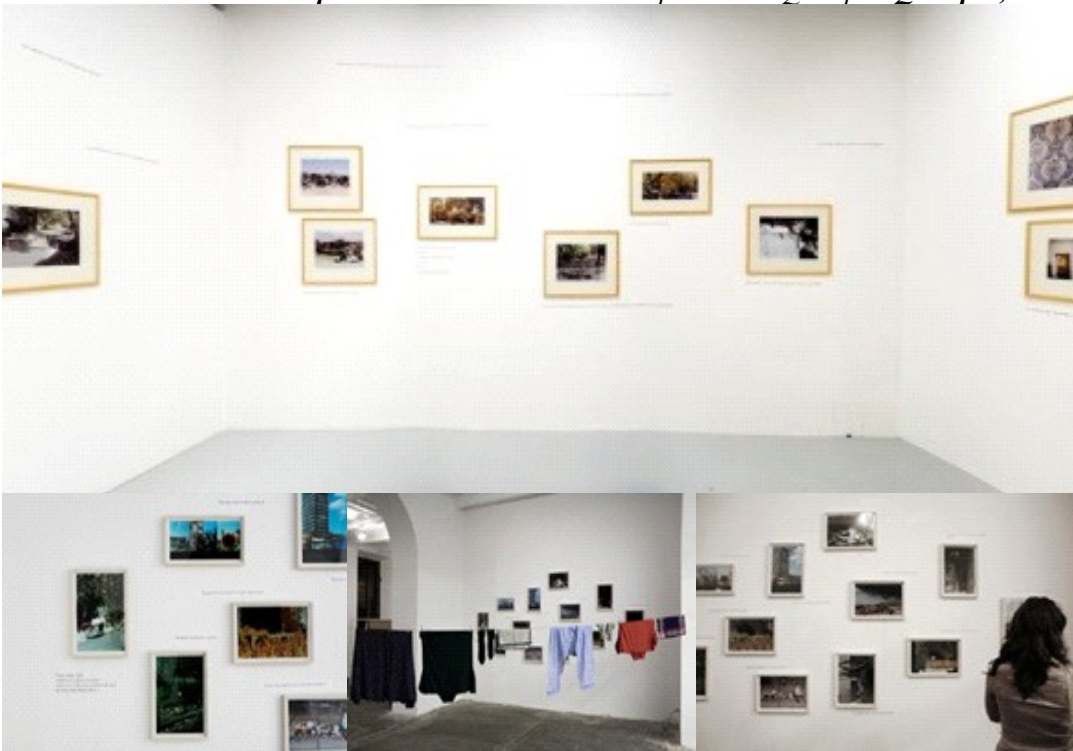
2009 "Very simple actions without any particular purpose" ARTRA Galleria, Milan, Italy