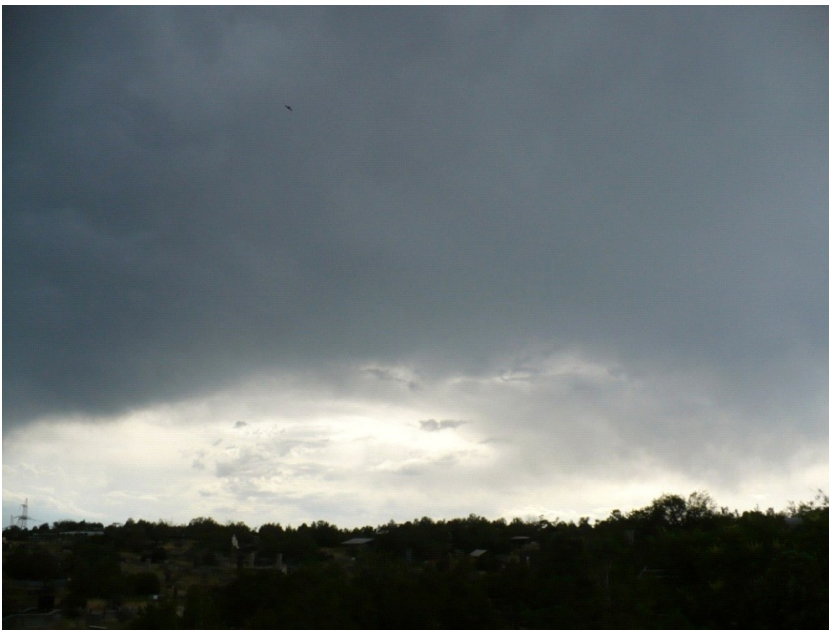
The artist lives somewhere far, far away .