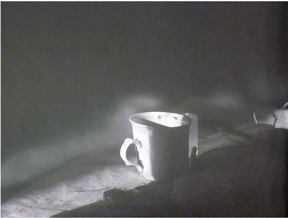
There is warmth in light. (30x40)