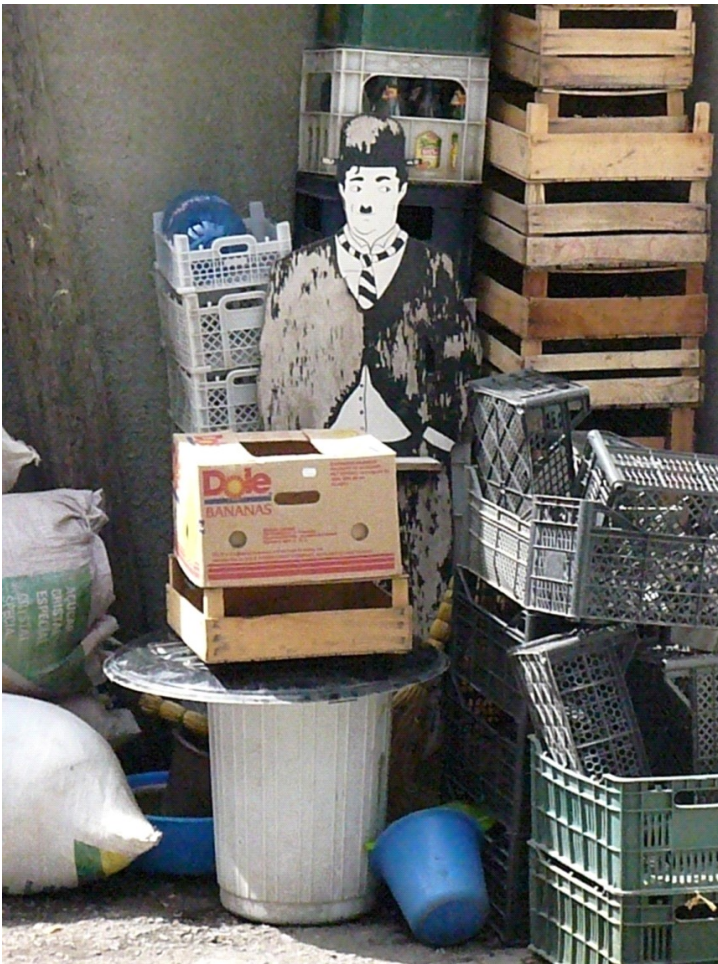
When someone falls, everyone laughs.(40x30)