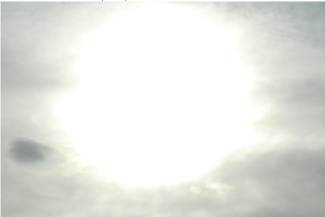
My heart wants sun.(30x40)