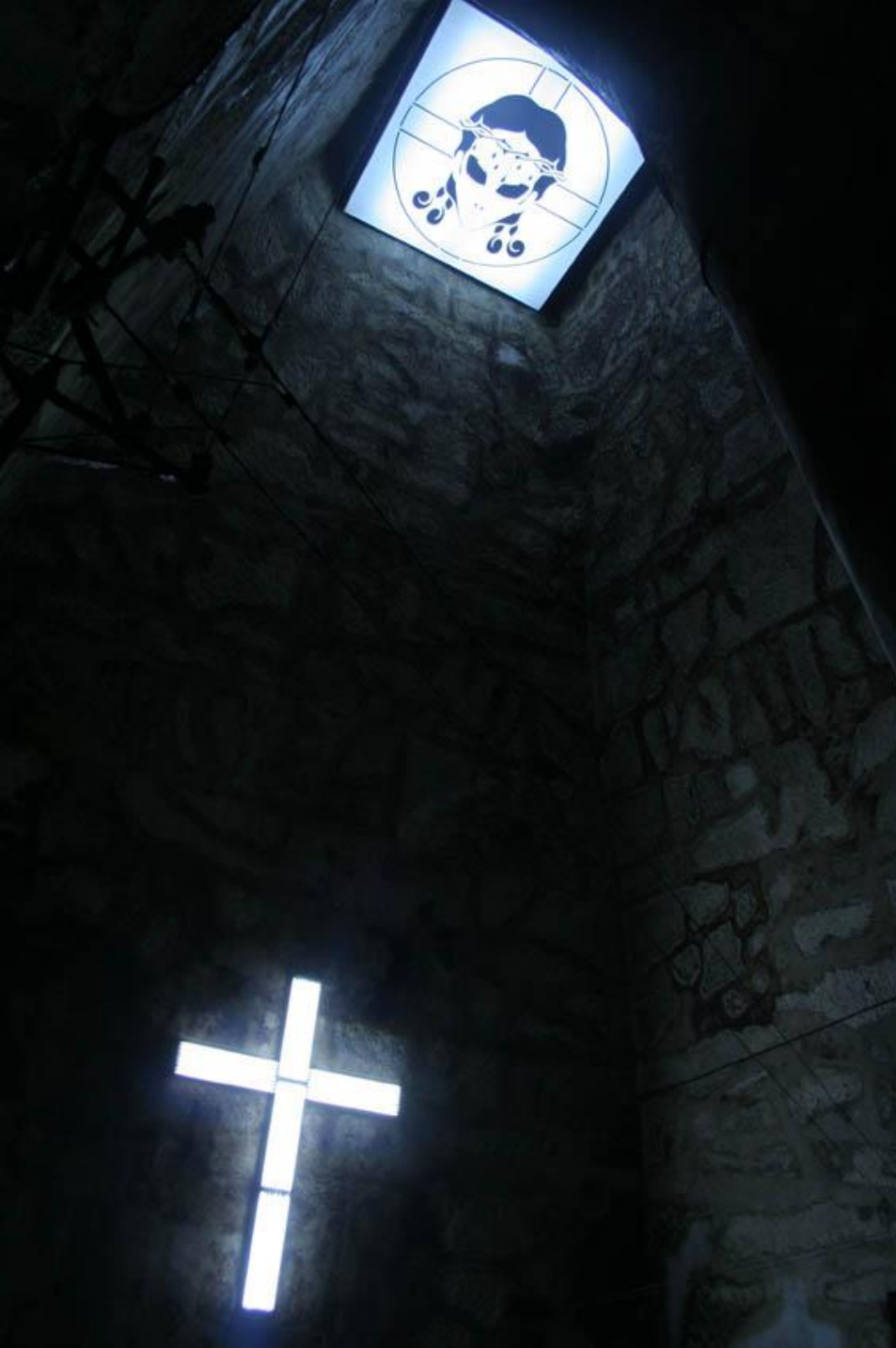
The Dawn of a New Era, light box 400cm/ 400cm/ 30cm

neon lights, motion detector 380 cm X 280 cm X 30 cm 2008